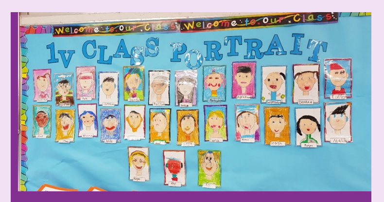
We created self-portraits in Arts.