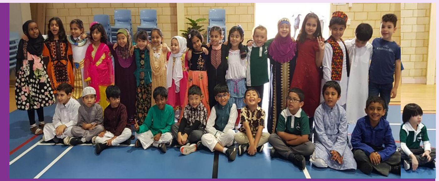
We had a Harmony Day Assembly and children wore their cultural clothes.