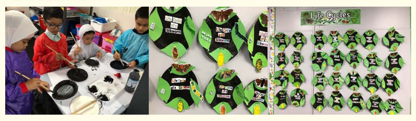
The summer season is the start of many things - fans, bugs coming out.... experiencing the hot summer. Students made

In Science students have been learning about life and living. They have learnt about the life cycles of different animals and insects. They created an art piece displaying The Life Cycle of a Silk Moth.