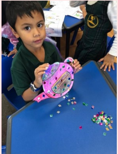
Cutting and pasting to develop our fine motor skills