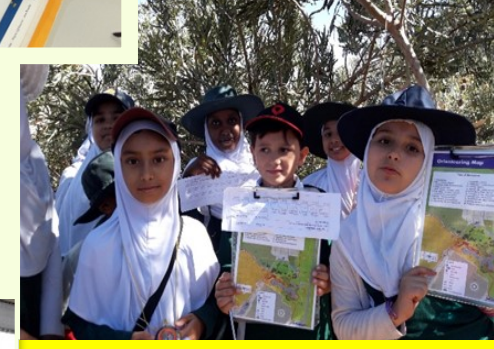
Orienteering' at Kings Park