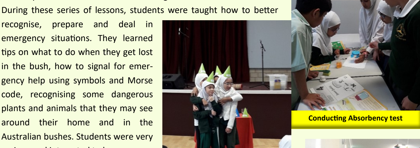
Demonstrating solid molecules during Science Alive incursion

recognise, prepare and deal emergency situations. They learned tips on what to do when they get lost in the bush, how to signal for emergency help using symbols and Morse code, recognising some dangerous plants and animals that they may see around their home and in the Australian bushes. Students were very curious and interested to learn.