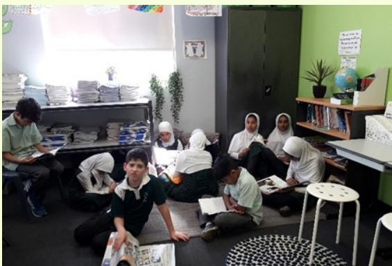
Enjoying reading session after science experiment.

Semester One has come to a close, students in Year 4 Yellow have been working really hard and very enthusiastically this semester. In Term One we learned about plant and animal life cycles. We conducted, observed and recorded an experiment about bean sprouts.